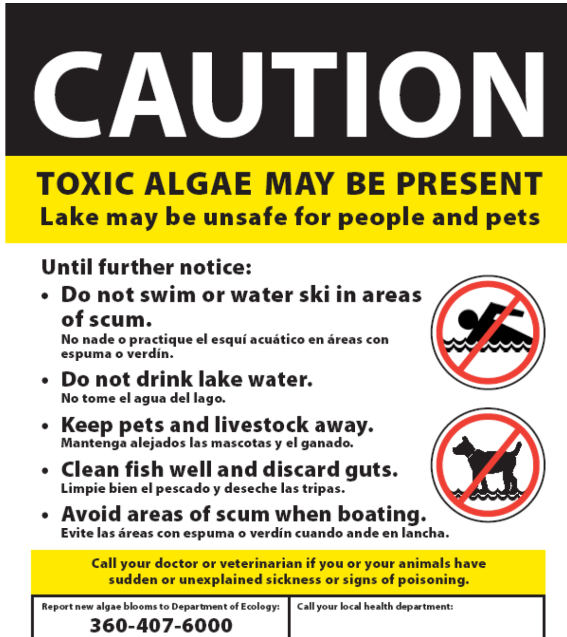
Figure A1. Caution sign for use in Tier 1.

For more information: www.doh.wa.gov/ehp/algae/ www.ecy.wa.gov/programs/wq/plants/algae/index.html